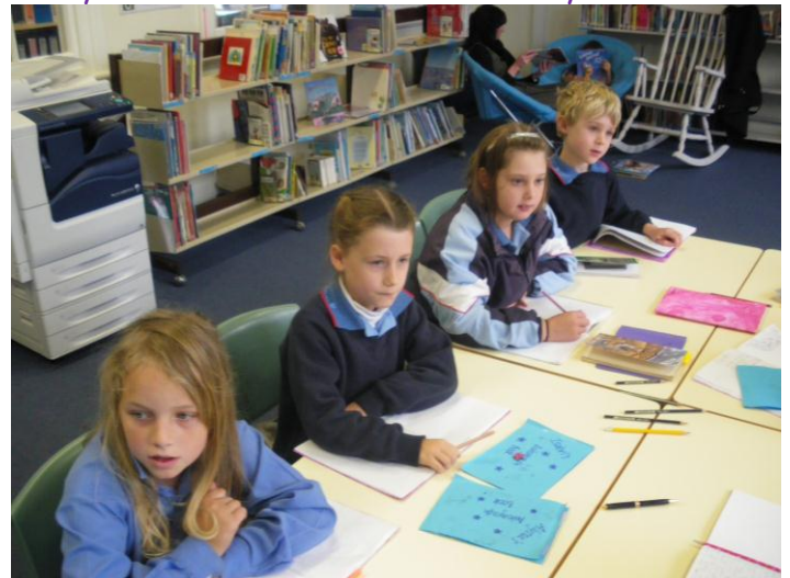
Students joining in the writing workshop.