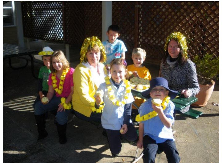
All in gold for morning tea!

On Thursday, in support of the Sydney Childrens hospital Gold Week fundraiser, the students of Chandler had a fundraising morning tea. Students wore gold to school, and made gold accessories during the day. We had a treasure hunt during the day, where a great loot of gold covered chocolate coins were found throughout the school yard. Students brought in donations and we were able to collect $42 (in real money) on the day. This is a great result for a small school, and I thank the Chandler community for the support of this fundraiser.