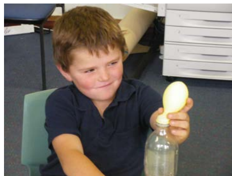
Deegan adds bicarb soda to a bottle of vinegar!