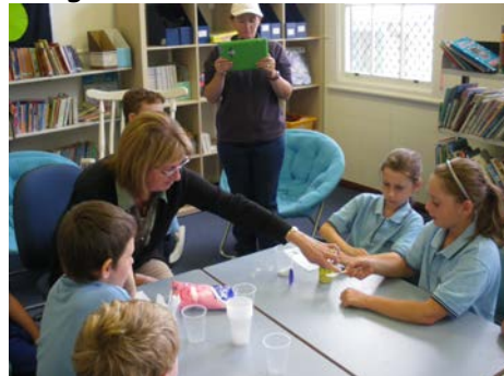
The best chemical reaction- making sherbert!