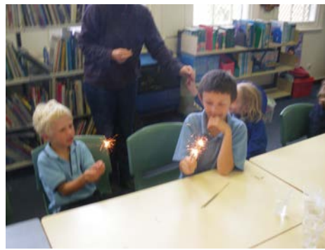
Chemical reactions during the burning of a sparkler.