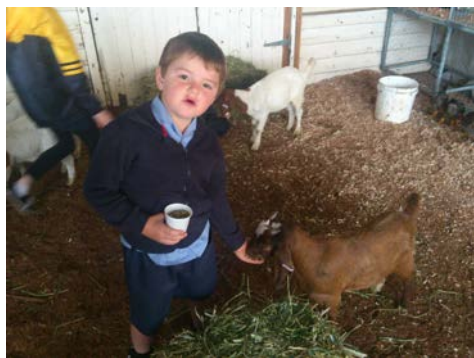
Deegan feeding a goat at the show.