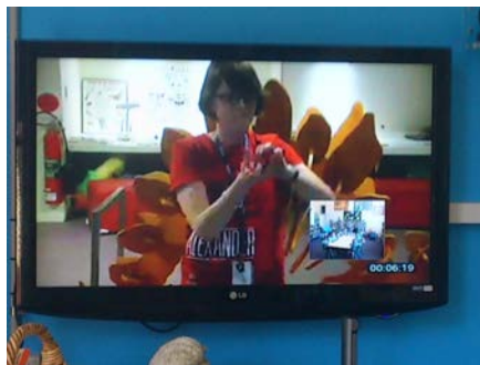
We did a video conference with the Australian museum called "Geology rocks!"