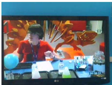
We learnt all tectonic plates.