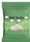
Mini rice wheels