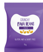
Roasted fava beans

For more ideas and recipes, visit www.swapit.net.au/recipes